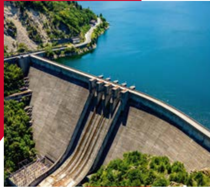
Energy suppliers Reliable supply of energy in all areas