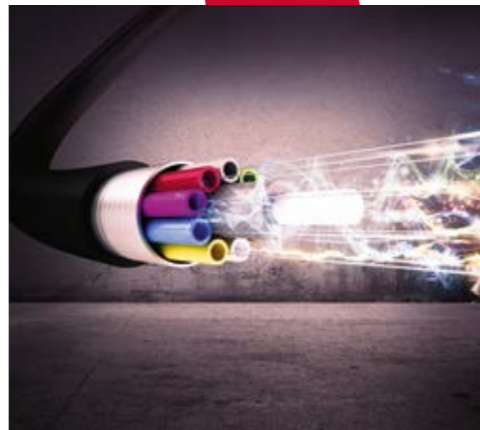
Telecommunications Fast and stable connections for the future